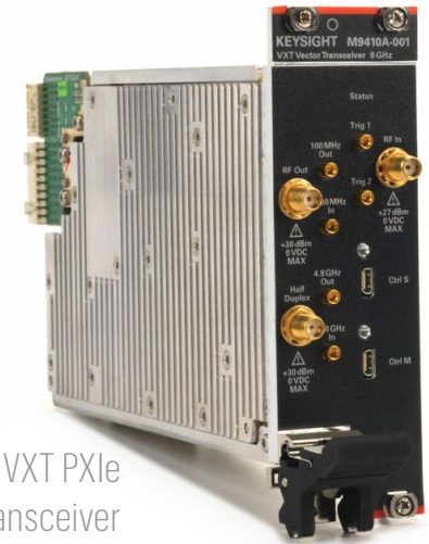
M9410A VXT PXIe vector transceiver