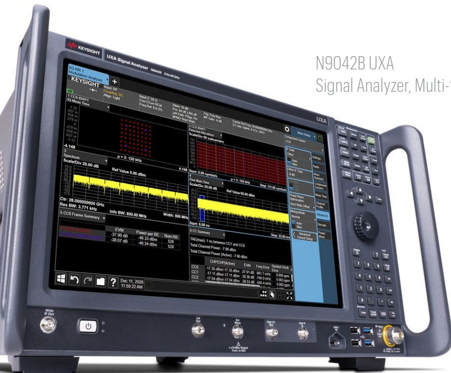
N9042B UXA Signal Analyzer, Multi-touch

Keysight offers signal analysis solutions to address your toughest test challenges.