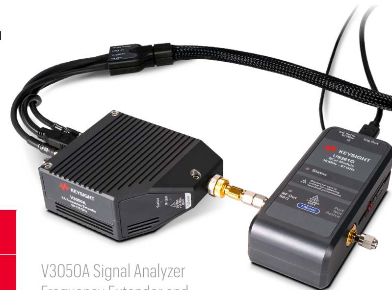
V3050A Signal Analyzer Frequency Extender and U9361 RCal Receiver Calibrator

Need microwave test accessories to complete your test setup? Keysight offers the most comprehensive selection including preamplifiers, comb generators, connectors, and switches.