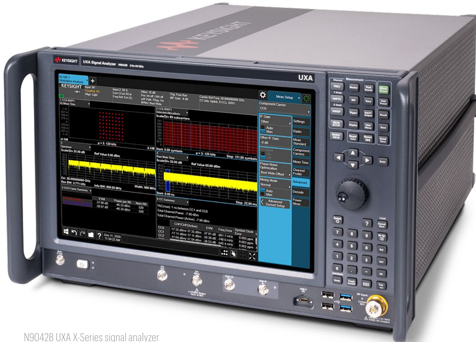
N9042B UXA X-Series signal analyzer