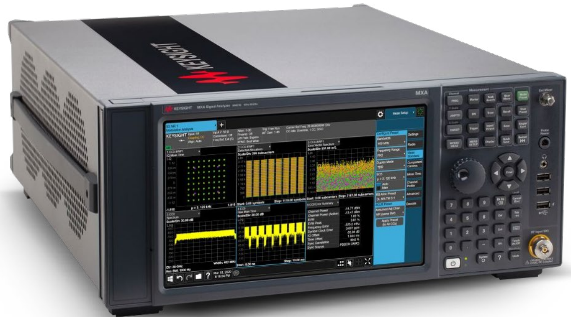
N9021B MXA X-Series signal analyzer