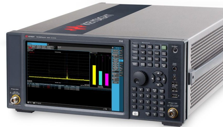
N9048B PXE EMI receiver